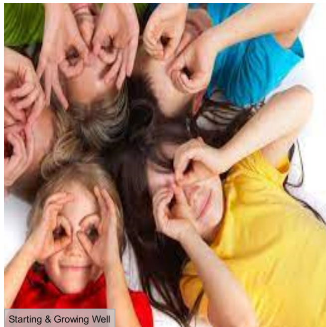
Starting & Growing Well