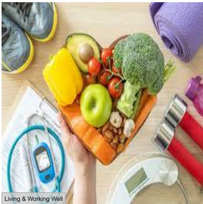
Living & Working Well