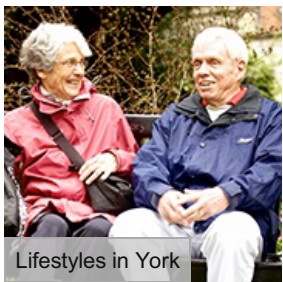
Lifestyles in York