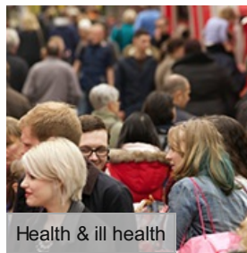
Health & ill health