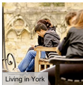
Living in York