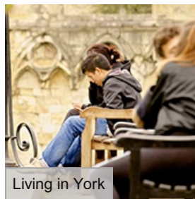
Living in York