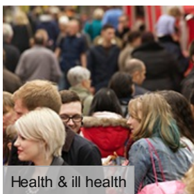
Health & ill health