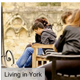
Living in York