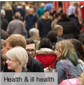
Health & ill health