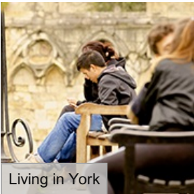
Living in York