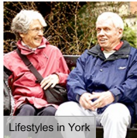
Lifestyles in York