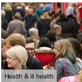
Health & ill health