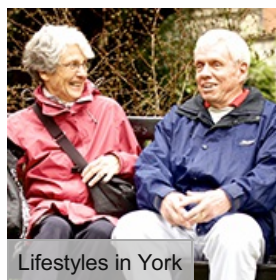
Lifestyles in York