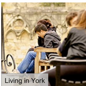
Living in York