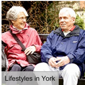
Lifestyles in York