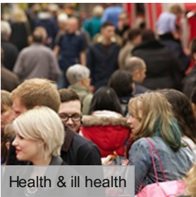
Health & ill health